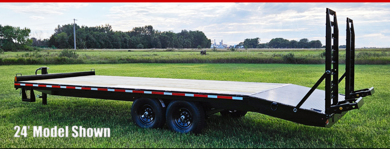
24' Model Shown