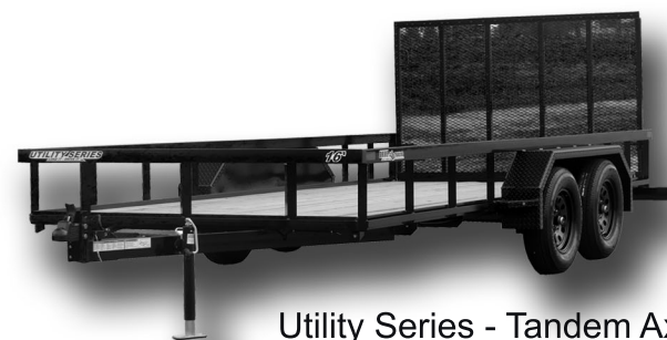
Utility Series - Tandem Axle and Single Axle